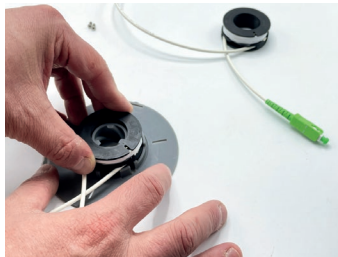
Insert the new fiber spool