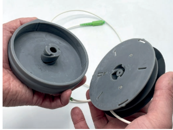
Separate the top and the base lid