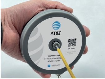
Remove the rear screw