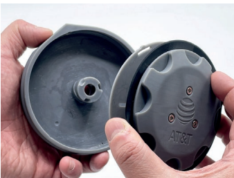
Re-assemble the top and base lid