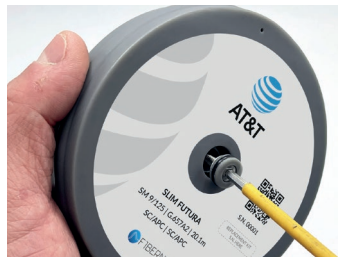
Tighten the rear screw