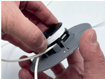
Extract the damaged fiber spool