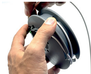
Coil the long fiber so that the connector can be properly placed in the housing