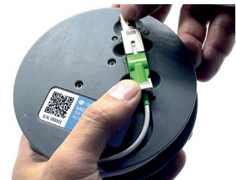
Place the connector in its housing