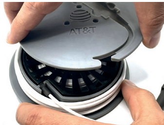
Separate the top and bottom lid