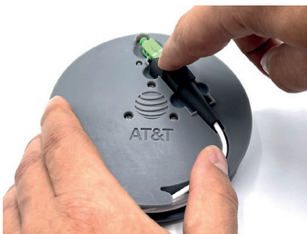
Place the short patch cord in the pre-shaped housing