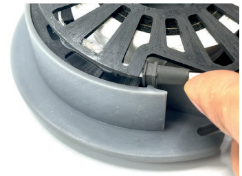
Make sure that the short patch cord is on the left side and that the rubber cone is properly placed in its housing