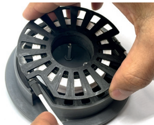
Insert replacement spool