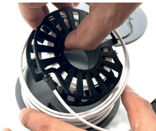
Extract the fiber spool