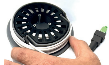
Unwind the fiber patch cords