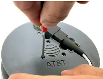
Remove the three front screws