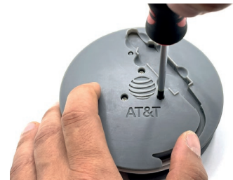
Fasten all three screws